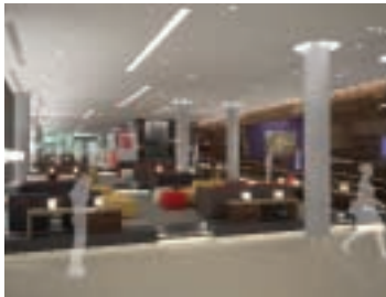
A computer generated image of how the lobby of the Hilton could look when it opens.

The topping-out ceremonies of 4 and 3 More London Riverside took place on 24 November and 8 December respectively, under a year since construction started. Topping-out is celebrated when the main structure of the building has been completed. The practice dates back centuries and was originally held to offer sacrifices to the gods to rid the building of evil spirits, which were believed to enter the building via the structure. In modern times it is the celebration of an important milestone and an opportunity to say thank you to those involved.