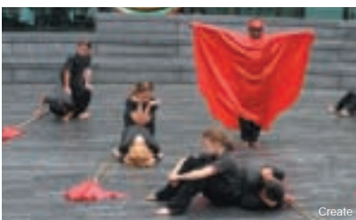
Translating Earth from the Air into dance.