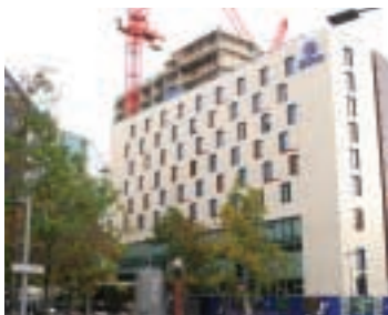
View of the London Hilton Tower Bridge from Tooley Street.